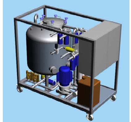
General Layout & Arrangement Drawing